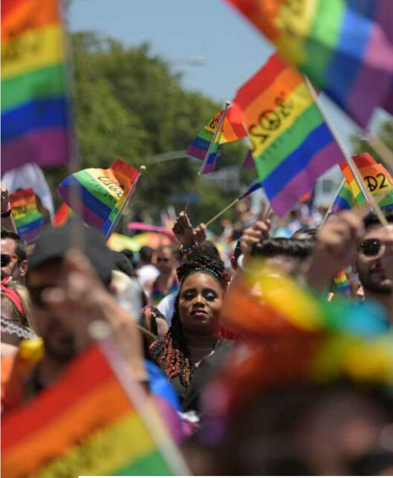
PRIDE PARADE

Right, so grow up, and educate yourself if you must.