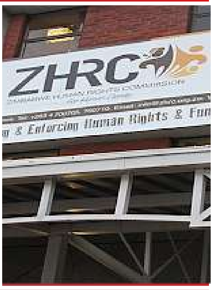
ZIMBABWE HUMAN RIGHTS COMMISSION

SOME LEARNERS WERE OF THE VIEW THAT SCHOOLS SHOULD OPEN AS THEY WERE GETTING IDLE AT HOME; SOME WANT TO FINALISE THEIR STUDIES THROUGH WRITING OF EXAMINATIONS. ANOTHER GROUP OF LEARNERS HIGHLIGHTED THAT THEY DO NOT WANT TO REPEAT CLASSES NEXT YEAR